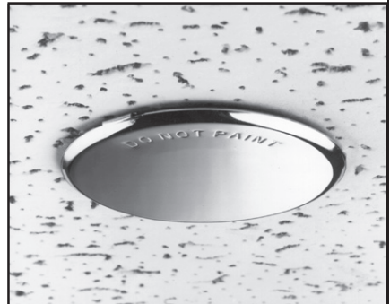
Viking Mirage® Concealed Pendent Sprinkler Installed in Acoustical Ceiling