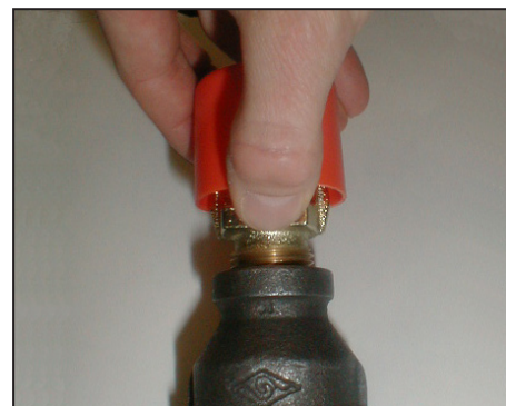
Figure 3: Sprinkler cap being removed from an upright sprinkler.