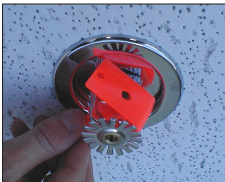
Figure 1: Sprinkler shield being removed from a pendent sprinkler.

SHIELDS AND CAPS MUST BE REMOVED FROM SPRINKLERS BEFORE PLACING THE SYSTEM IN SERVICE!