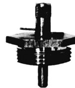
Auxiliary Valve Setting Tool P/N 02039B