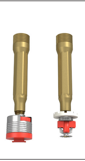
Model FSC-28B Pre-assembled

Ordering Information: (Also refer to the current Viking price list.)