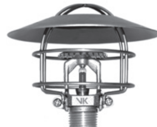
Upright Intermediate Level Sprinkler (with Guard and Water Shield)

Order Water Shield Separately. (Field Assembly Required.) See Installation Instructions.) Order Sprinkler Guard Separately or Factory Installed. (See Ordering Instructions.)