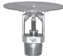
Upright Intermediate Level Sprinkler (Factory pre-assembled only)

Upright Intermediate Level Sprinklers (with Model D-1 Sprinkler Guards): For Upright Intermediate Level Sprinklers with guards (Figure 2), the special water shield must be ordered separately and installed in the field. Refer to page 4 for upright sprinklers listed and/or approved for installation with water shields.