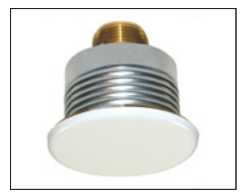
For Light Hazard Occupancies Only

The sprinkler is pre-assembled with a threaded adapter for installation with a low-profile cover assembly that provides up to 1/2" (12.7 mm) of vertical adjustment. The two-piece design allows installation and testing of the sprinkler prior to installation of the cover plate. The "push-on", "thread-off" design of the concealed cover plate assembly allows easy installation of the cover plate after the system has been tested and the ceiling finish has been applied. The cover assembly can be removed and reinstalled, allowing temporary removal of ceiling panels without taking the sprinkler system out of service or removing the sprinkler.