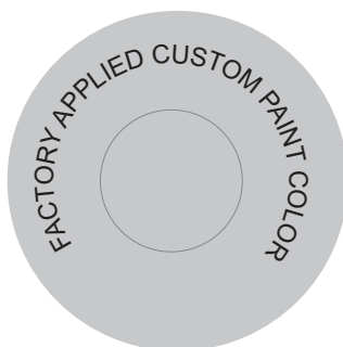
Figure – 2 Custom Paint Identification for Concealed Covers

All custom color painted cover plates will have an identifying label affixed to the cover's inside. The label indicates what the custom color is and will have a custom color representative sample (i.e., a paint dot).