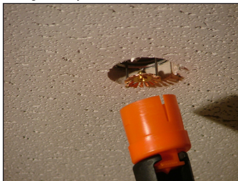
Figure 2: Use Sprinkler Wrench 14031 to remove the protective sprinkler cap.