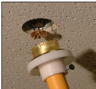
Figure 4: Use the Cover Installer Tool to Install the Mirage® Concealed Cover Plate.