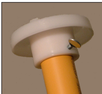
Figure 3: Attach the Cover Installer Tool onto the end of CPVC pipe.