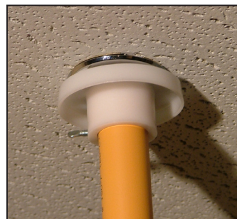
Figure 5: Correct use of the Cover Installer Tool

Refer to the latest appropriate technical data pages for complete care, handling, and installation instructions. Data pages are included with each shipment from Viking or Viking distributors. They can also be found in your Viking technical data book and on the Web site at www.vikinggroupinc.com .