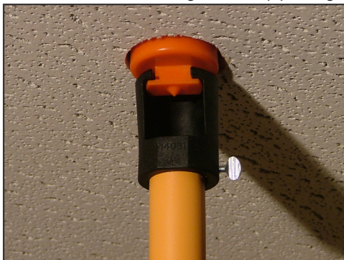
Figure 1: Attach Sprinkler Wrench 14031 onto a length of 1" diameter CPVC pipe