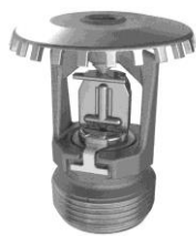
Micromatic® Model M Standard Response Standard Coverage FUSIBLE LINK

Upright Sprinklers Thread Size: 3/4 inch NPT