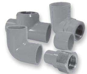
BlazeMaster® is a registered trademark of The Lubrizol Corporation.

This warranty gives you specific legal rights, and you may also have other rights which vary from state to state and country to country.