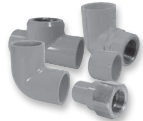
BlazeMaster® is a registered trademark of The Lubrizol Corporation.

This warranty gives you specific legal rights, and you may also have other rights which vary from state to state and country to country.