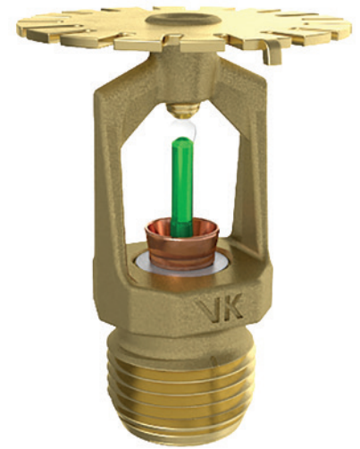
Combustible Interstitial Space Sprinkler COIN® VK950 5.6K Quick Response