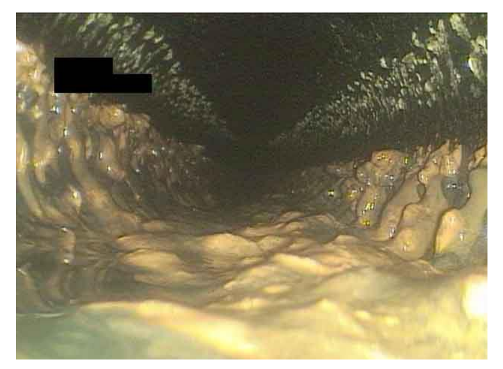
Figure 3. Video-borescope screen capture from wet sprinkler system inspection showing accumulated corrosion product deposits below the air/water interface at approximately the 3 and 9 o'clock locations.

Conversely, in wet sprinkler systems, the corrosion is usually located at high points in the sprinkler piping where trapped air pockets can exist. Trapped air will eventually rise and accumulate at the highest points in a sprinkler system, creating an air/water interface, which results in corrosion damage at the higher elevations in affected systems as shown in Figure 3.