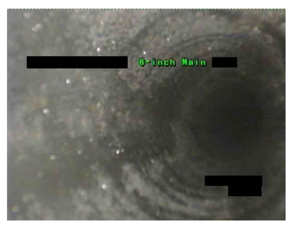
Figure 2. Video-borescope screen capture showing no corrosion other than normal zinc oxidation in pre-action system without residual water.

Figure 1. Video-borescope screen capture from pre-action sprinkler system inspection showing accumulated corrosion product deposits below the air/water interface at approximately the 4 and 8 o'clock locations.