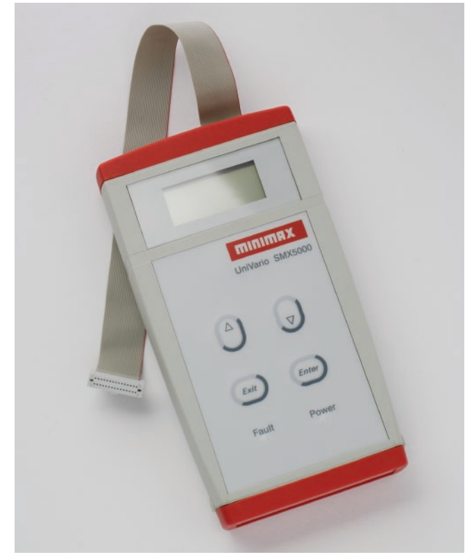
SMX5000 Service Tool