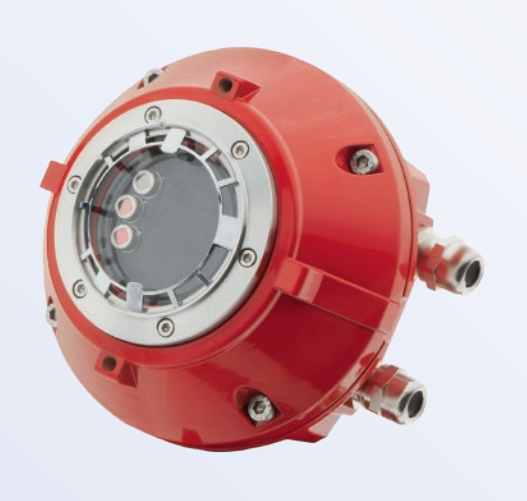
Viking Special Hazards