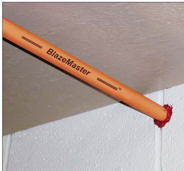
2 Hour Fire Rated Through Penetration Firestop for Single Plastic Pipe through Concrete Floors or Walls using BlazeMaster® Caulk & Walk®

BlazeMaster® CPVC fire sprinkler systems have been used successfully for more than 16 years in building construction and renovation. BlazeMaster® systems are ideally suited for use in fire protection primarily due to their ease of installation, outstanding corrosion resistance, low flame spread and low smoke characteristics. These properties can however be compromised if the CPVC pipe comes in contact with incompatible chemicals found in some construction products.