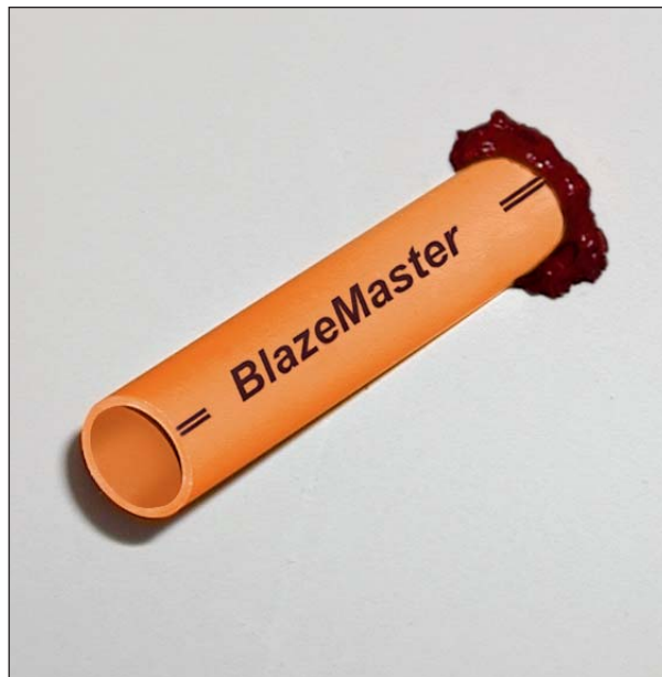
1 or 2 Hour Fire Rated Through Penetration Firestop for Single Plastic Pipe through Gypsum Walls using BlazeMaster® Caulk & Walk®

One area where these incompatibilities can be found is in firestopping sealants. Certain firestopping sealants within the industry contain chemicals that are incompatible with CPVC piping systems. These chemicals can cause the wall of the CPVC pipe to weaken and may even cause environmental stress fractures. BlazeMaster® Caulk & Walk® is a specially formulated firestopping sealant made to ensure that a chemically induced failure will not occur when used with BlazeMaster® CPVC fire sprinkler systems.