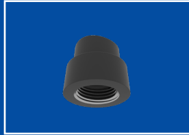
A gasketed welded outlet

Ditch the wrench with this new technology.