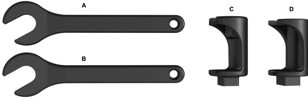
Figure 1: Sprinkler Wrenches

The Viking Corporation, 210 N Industrial Park Drive, Hastings MI 49058 Telephone: 269-945-9501 Technical Services: 877-384-5464 Fax: 269-818-1680 Email: techsvcs@vikingcorp.com Visit the Viking website for the latest edition of this technical data page: www.vikinggroupinc.com