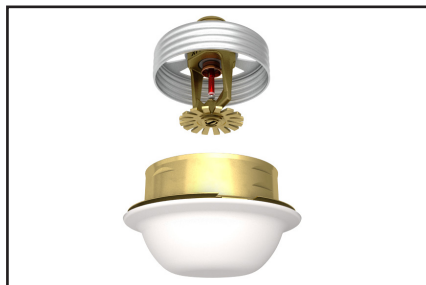
Cover Plate Assembly (Pendent Cover 12381 shown)