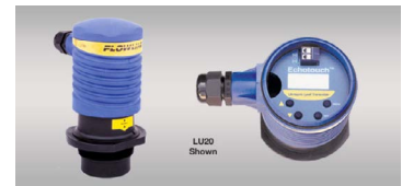
Echotouch Ultrasonic Level