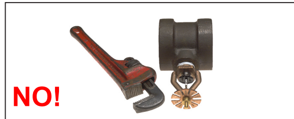
Figure 4: Incorrect installation wrench (ESFR sprinkler shown with a pipe wrench)