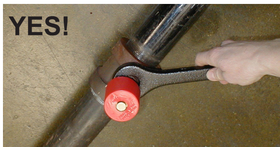
Figure 1: Correct use of designated installation wrench with ESFR Pendent K14 Sprinkler SIN VK500 and sprinkler cap

DO NOT install sprinklers onto piping at the floor level. Install sprinklers after the piping is in place at the ceiling to prevent mechanical damage.