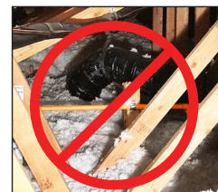
INCORRECT (Exposed piping)