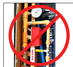
INCORRECT (No pressure relief valve)

WARNING: Cancer and Reproductive Harm- www.P65Warnings.ca.gov