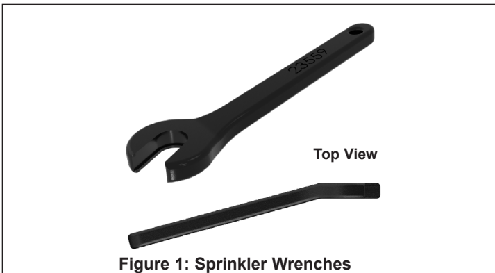
Figure 1: Sprinkler Wrenches