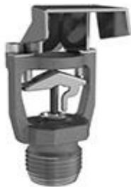
Attic Sprinkler (Model V-EP), Specific Application (Eave Protection), Glass Bulb, ½ inch NPT