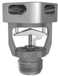
Attic HIP (Model V-HIP), Specific Application, Glass Bulb, ½ inch NPT