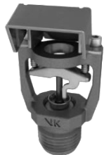
Single Directional (Model V-SD) Attic Sprinkler, Specific Application, Glass Bulb, ½ inch NPT