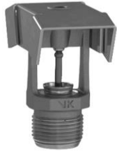
Back-to-Back (Model V-BB) Attic Sprinkler, Specific Application, Glass Bulb, ½ and ¾ inch NPT