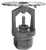
Attic Upright Sprinkler, Specific Application, Glass Bulb, ½ inch NPT