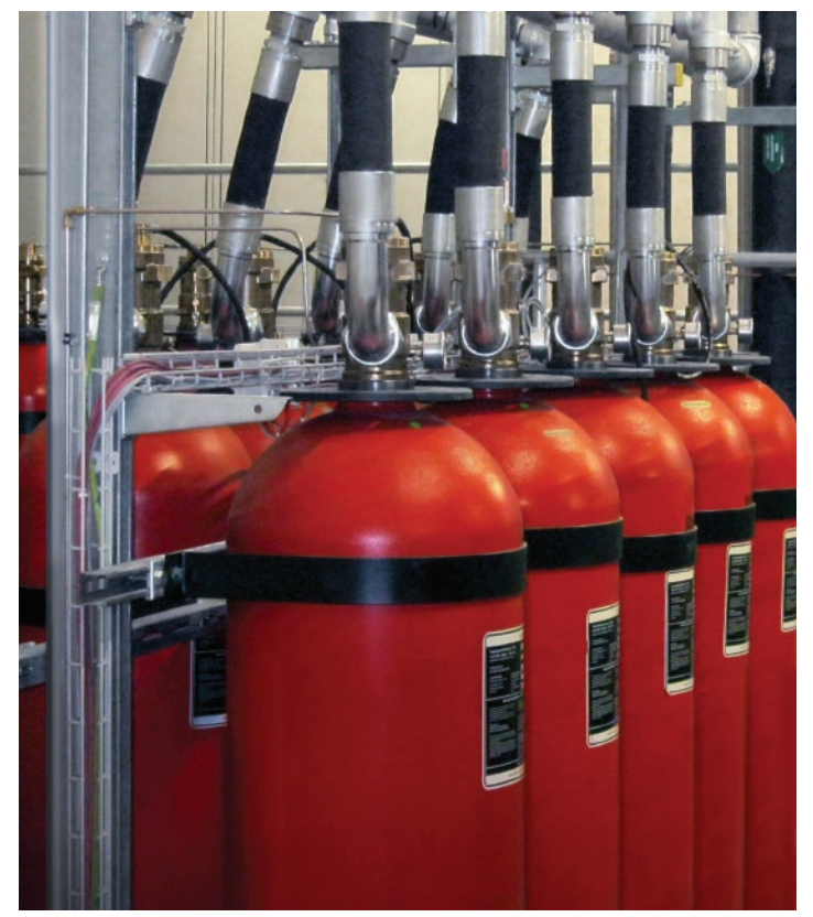
Viking Special Hazards can provide multi-cylinder and multi-zone systems to protect any special hazard area.