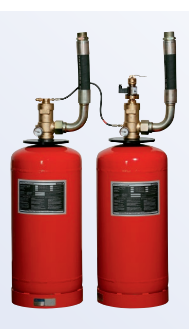
Viking Special Hazards