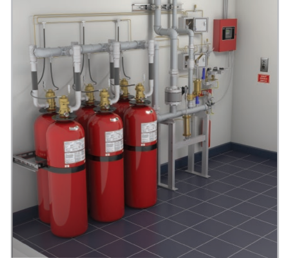
725 psi systems make it possible to locate agent supply away from the protected area.