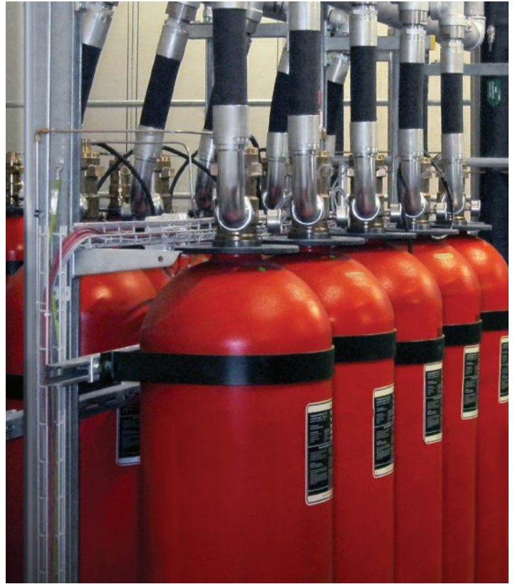
Viking Special Hazards can provide multi-cylinder systems to protect any special hazard area.