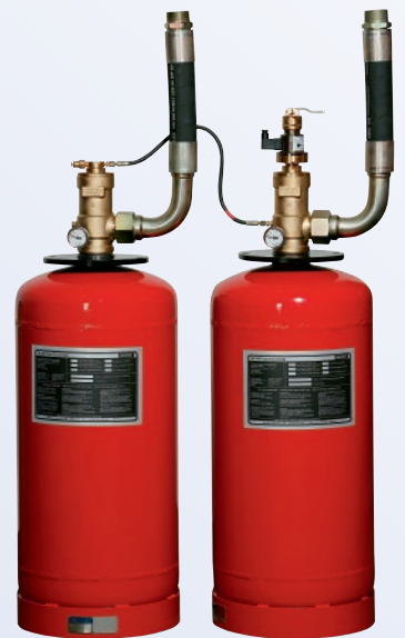
Viking Special Hazards