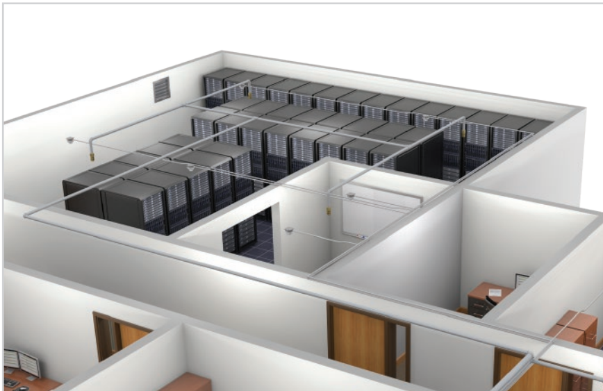
725 psi systems make it possible to locate agent supply away from the protected area.