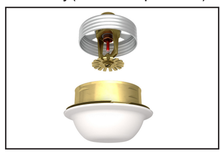
Cover Plate Assembly (Pendent Cover 12381 shown)

Concealed Sprinkler and Adapter Assembly (Protective Cap Removed)