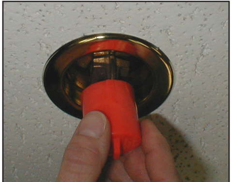
Figure 2: Sprinkler cap being removed from a pendent sprinkler.