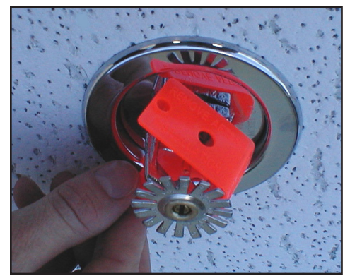
Figure 1: Sprinkler shield being removed from a pendent sprinkler.

SHIELDS AND CAPS MUST BE REMOVED FROM SPRINKLERS BEFORE PLACING THE SYSTEM IN SERVICE!