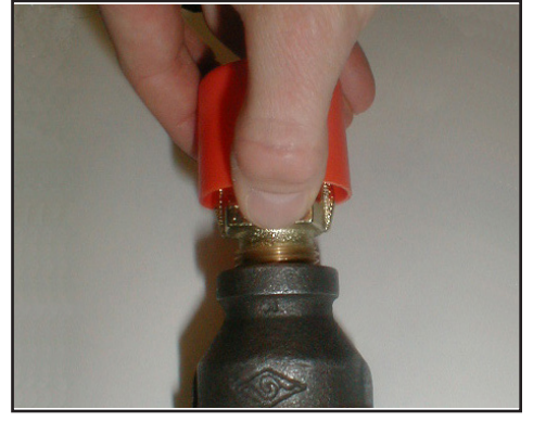
Figure 3: Sprinkler cap being removed from and upright sprinkler.