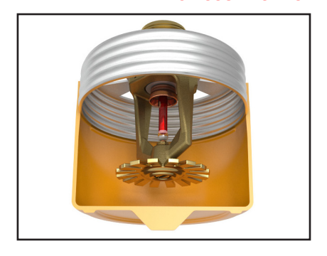
Concealed Sprinkler and Adapter Assembly with Protective Cap

▲ CAUTION CONCEALED COVER ASSEMBLIES ARE FRAGILE! TO ASSURE SATISFACTORY PERFORMANCE OF THE PRODUCT, HANDLE WITH CARE.