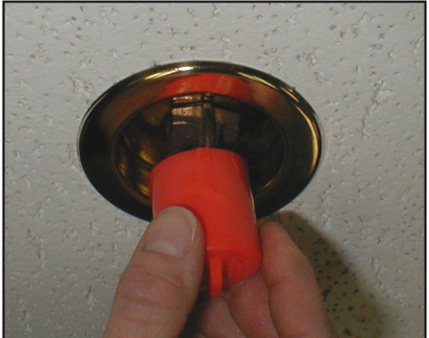
Figure 2: Sprinkler cap being removed from a pendent sprinkler.