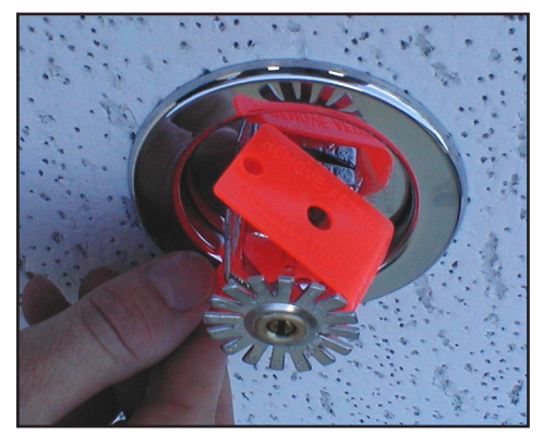
Figure 1: Sprinkler shield being removed from a pendent sprinkler.

SHIELDS AND CAPS MUST BE REMOVED FROM SPRINKLERS BEFORE PLACING THE SYSTEM IN SERVICE!