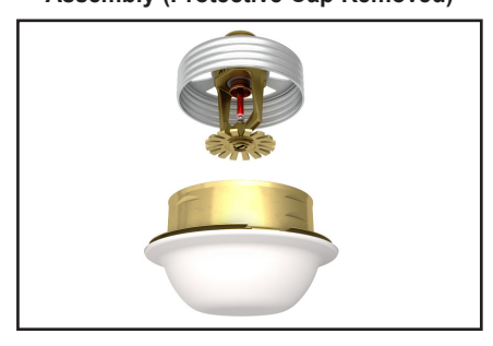
Cover Plate Assembly (Pendent Cover 12381 shown)

Concealed Sprinkler and Adapter Assembly (Protective Cap Removed)